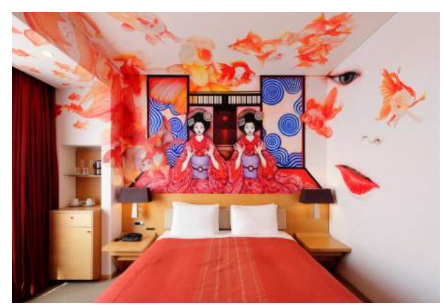
D. Artist Room Geisha Goldfish