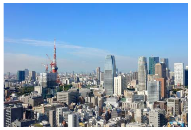
C. View from Park Hotel Tokyo

Park Hotel Tokyo is a highly rated hotel and they actively incorporate art in their branding. 2 years ago, they were awarded the Excellence in Field of Domestic and Inbound Travel Award at the 3rd Japan Tourism Awards for their innovative program: "Artist in Hotel", in which they transformed hotel rooms into Artist Rooms. Outside the windows of the hotel spread views of Hamarikyu Gardens on the east and Tokyo Tower on the west. We hope the fair guests will enjoy the fantastic views and luxurious atmosphere along the great artworks.