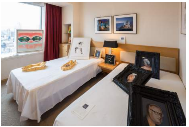
F. Aki Gallery, ART in PARK HOTEL TOKYO 2018