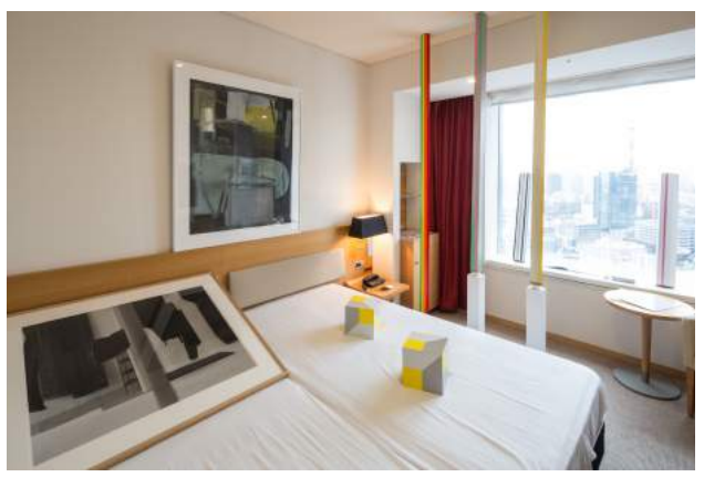
E. Soh Galley, ART in PARK HOTEL TOKYO 2018