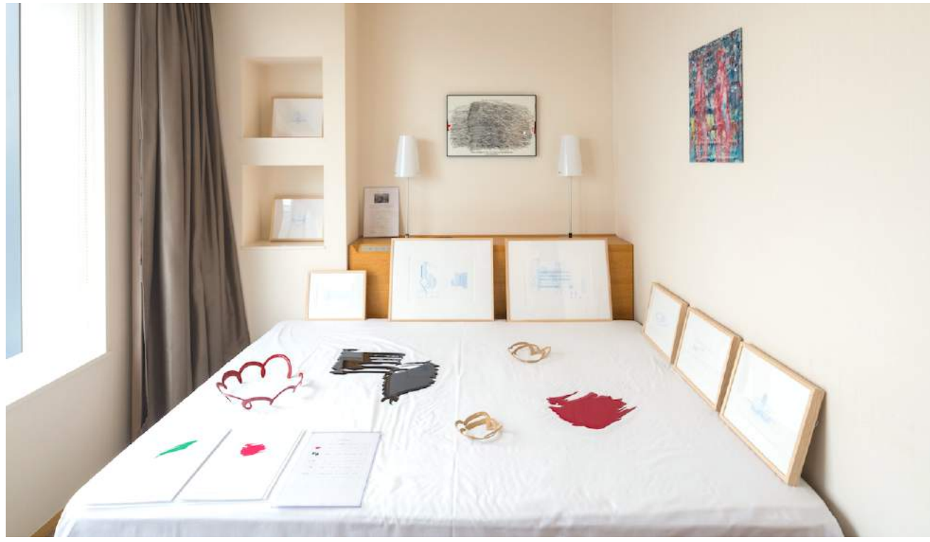
A. FINCH ARTS, ART in PARK HOTEL TOKYO 2018

March 9 (Sat)—10 (Sun) , 2019 | Preview: March 8 (Fri) PARK HOTEL TOKYO, Shiodome